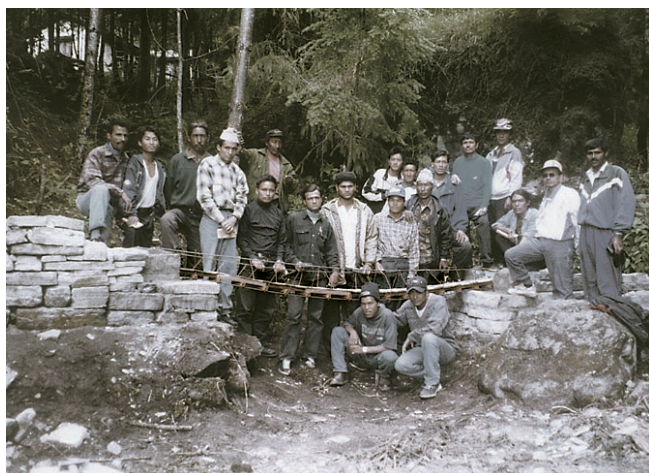
A demonstration miniature bridge is presented to villagers, illustrating all the technical issues involved

The programme has designed specific courses and training materials for universities, colleges and vocational training schools. For such practitioners as trail bridge engineers and supervisors, tailor-made courses are conducted at engineering schools and include not only technical but also managerial and social aspects. The capacity building programme includes 34 educational institutes (1 university, 5 colleges, 28 vocational schools) and involves practitioners from central and local government, the private sector and NGOs in all 75 districts.