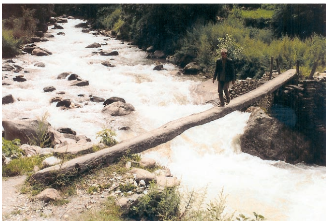
At Chuti, Bajura, a wooden log served as a bridge before...