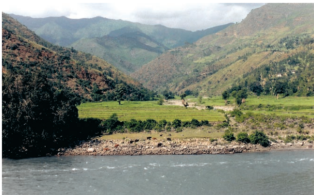
Sitka Ghat, Ramechhap, before...