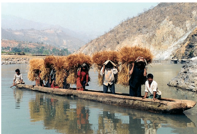
Molung, Okhaldha, the ferry boat before...