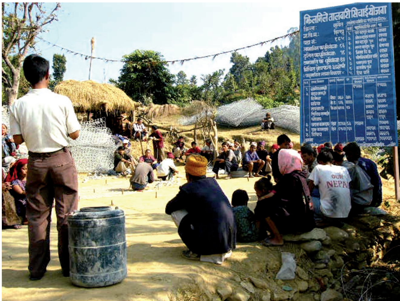
Public audit: villagers assemble to assess whether the money was well spent

One of the innovative ‘controlling’ measures in Nepal is ‘Public Auditing’: the audit takes place in a large open space, with all villagers invited. The district engineer, social mobilisers and the User Committee make public the amount of funds received from the government and donors, and explain how they have been spent, especially how they were distributed as wages amongst the workers. The labourers can then cross-check their wages against the expenditure of the programme.