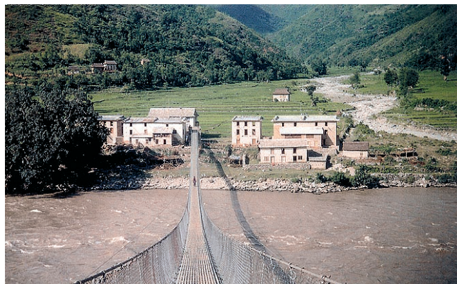
and after bridge construction