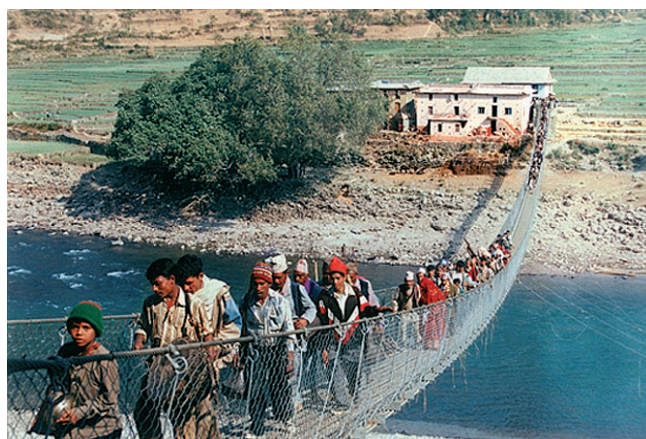
and a wedding party after the bridge construction