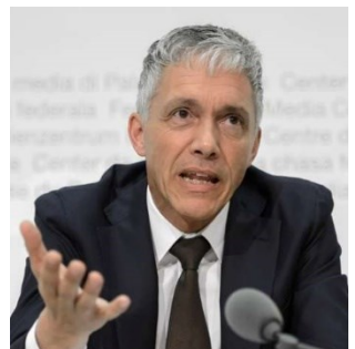
FIFA case: Attorney General Michael Lauber investigated by the Swiss judiciary for possible misconduct

pressure Bern into signing the agreement. News reports also referred to the drawn-out negotiation process and numerous compromises made by the EU. The European press was largely supportive of the EU's standpoint and, on the whole, the conflict between Switzerland and the EU was seen as detrimental to both sides. However, some media outlets clearly positioned themselves for or against Switzerland. German and Austrian media were especially critical of what they perceived as reticence on the part of the Swiss government. Meanwhile, in the context of Brexit, much of the British media tended to side with Switzerland.