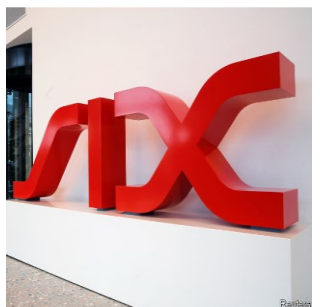
Images of the Swiss stock exchange used to illustrate reports on Swiss–EU relations