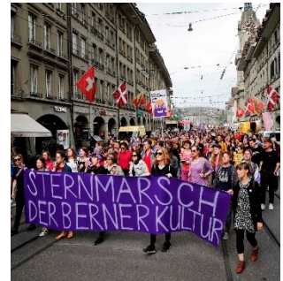
The women's strike in Bern

«The scandal [...] threatens to cast a long shadow over Switzerland's reputation as a reliable partner in international efforts to combat financial corruption» (Financial Times, UK)