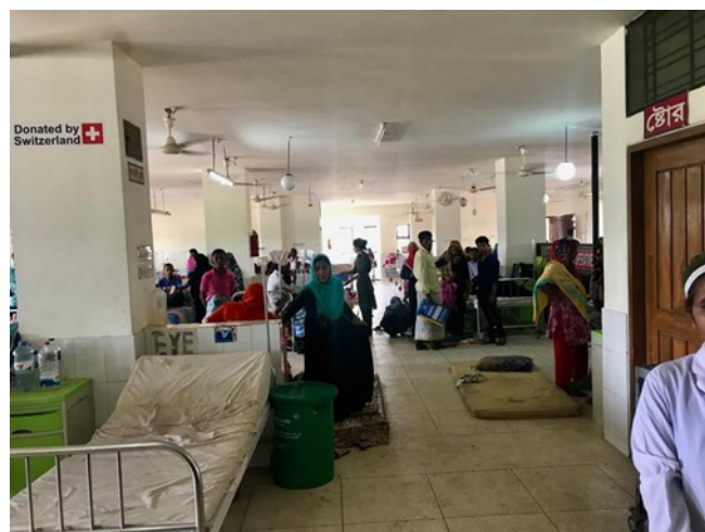
SWISS TALK 34

From the beginning of the Rohingya crisis last year, Switzerland has remained firm in its commitment to the people and government of Bangladesh in addressing the influx of Rohingya refugees in Bangladesh. Until December 2018, Switzerland has committed over 20 million CHF to numerous UN and other aid agencies who provide lifesaving services and support in the refugee camps. The majority of the support is geared to meet the needs of the refugees in