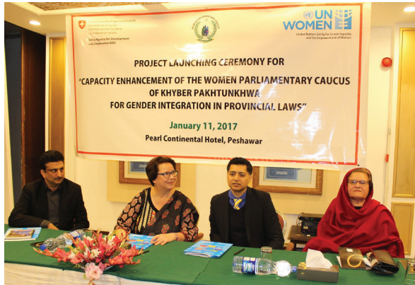
Signing of the agreement

Swiss Agency for Development and Cooperation SDC