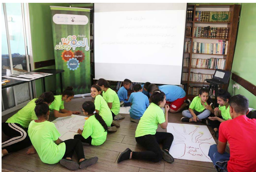
Enhancing positive participation and engagement of children in cultural, recreational, awareness raising and life skills activities at 5 CBOs in East Jerusalem, supported through PalVision.

With increasing poverty and unemployment, more than 82% of Palestinian children of East Jerusalem live in households that are below the Israeli poverty line. Expenditures into public services are higher – in absolute and per capita terms – in West Jerusalem and in East Jerusalem Israeli settlements than in the Palestinian neighborhoods of East Jerusalem. Consequently, the latter areas suffer from lack of parks, playgrounds and classrooms. The streets are dirty because of inadequate garbage collection and little recreational activities are available for children below 6 or above 15.